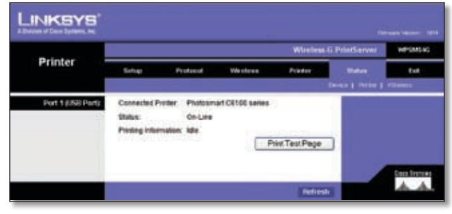
Status > Printer

The Printer screen displays the current settings of the printer. No values can be changed on this screen. Click the Refresh button to update the information on this screen.